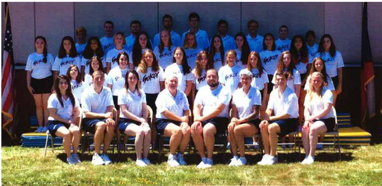
2018 American Sokol Instructor's School Sokol Greater Cleveland Cleveland, Ohio

A tremendous thank you to the staff that did an outstanding job! I would also like to extend a big thanks to the helpers and volunteers; the awesome students and once again the American Sokol for continuing to support this important and worthwhile venture! NAZDAR!