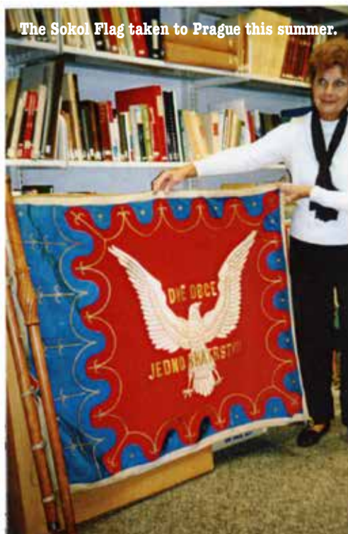
The Sokol Flag taken to Prague this summer.