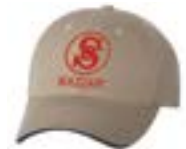
KHAKI BASEBALL QTY: _____