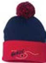
KNIT POM QTY: _____