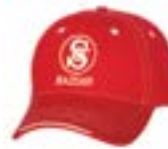
RED BASEBALL QTY: _____