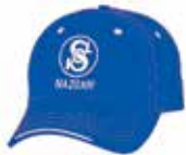
ROYAL BASEBALL QTY: _____