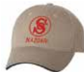
KHAKI BASEBALL QTY: _____