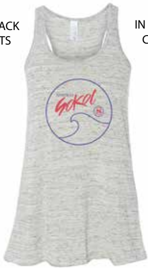
IN OVER 40 COLORS