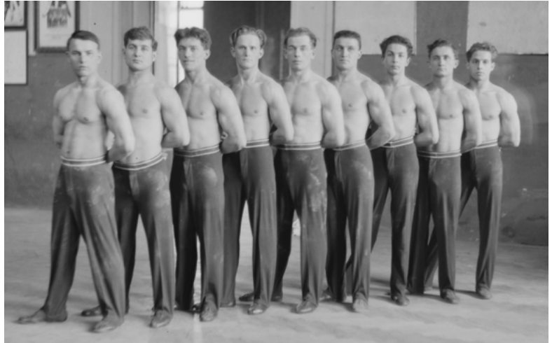
Sokol sports team, around 1920.