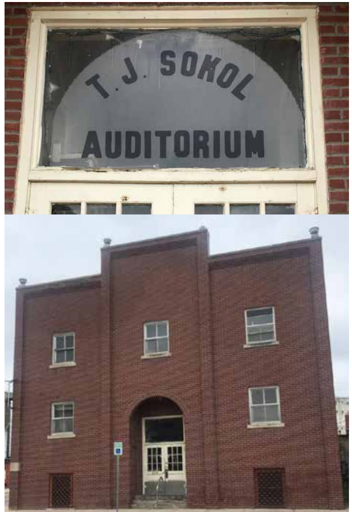
Sokol Crete, Crete, Nebraska

Ať žije Sokol! ~ Long Live Sokol! Nazdar!